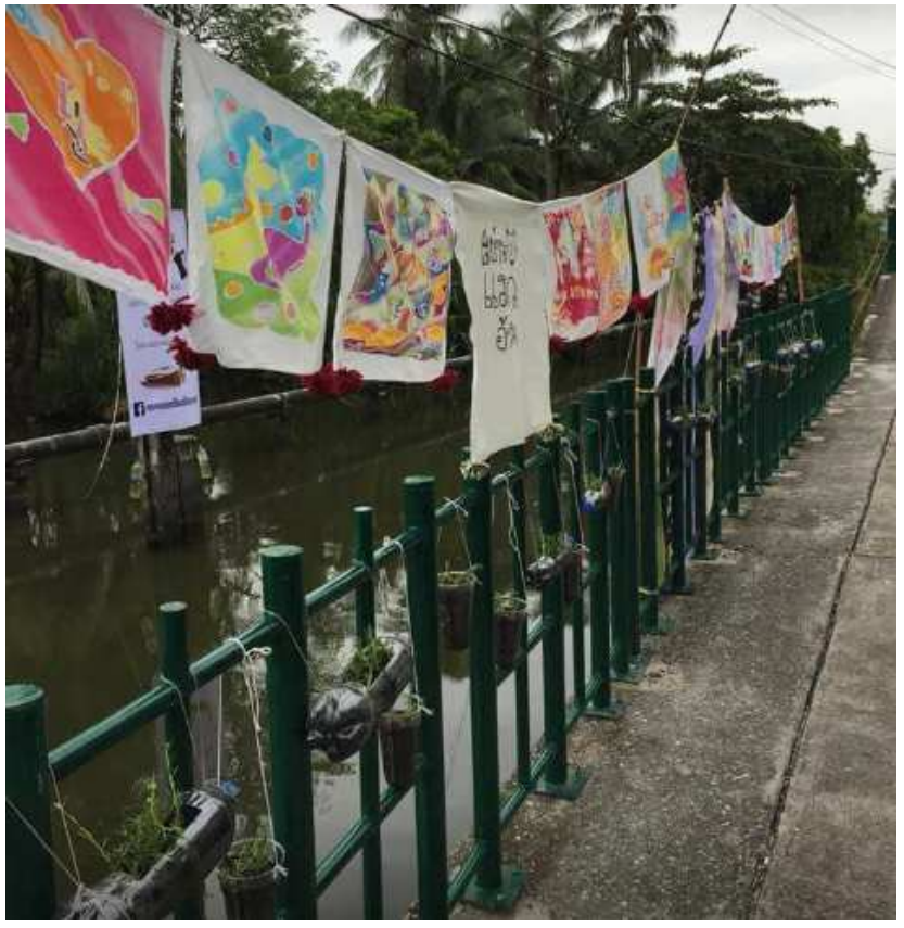
(a).TalardModthanoi Floating market

Halal Floating Markets: New Trend for Promotion of Tourism and Safe Food for Muslim: Cases from Thailand Pathum S et al. 22