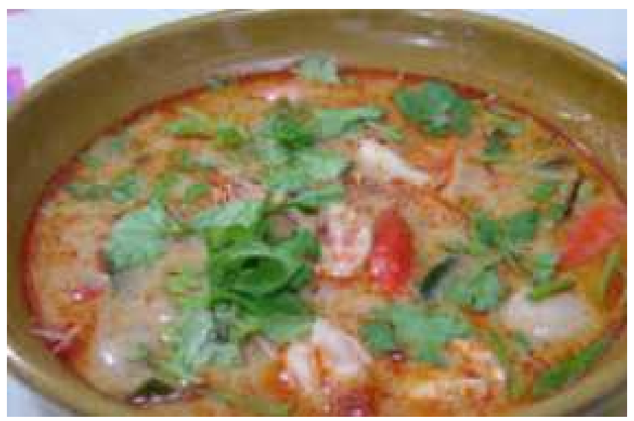
Figure 2. Making a good tasty spicy soup with good odor

Of interest, the use of local wisdom is usually related to the use of herbal odorous recipes which are helpful in promote health of the consumer.